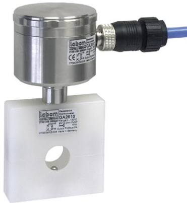
Temperature transmitter with field housing and PROFIBUS PA plug connector (patented measuring system)